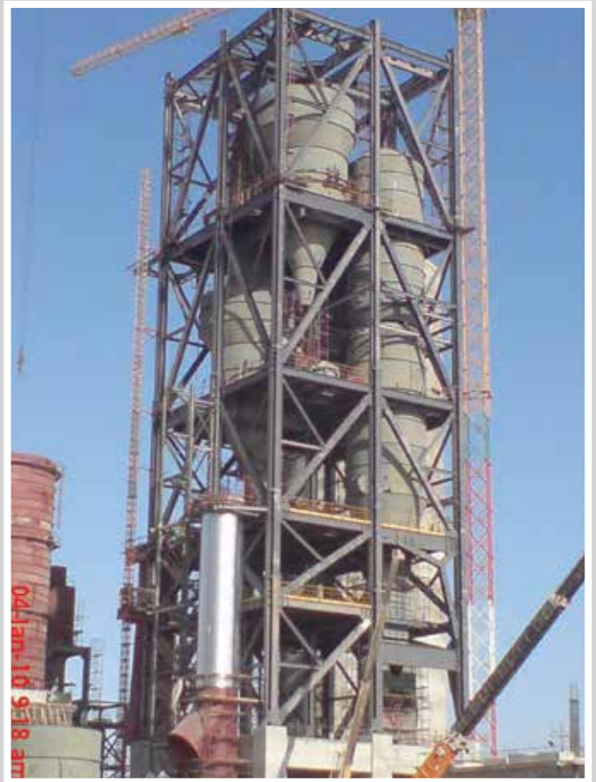
ESCC-ELSEWEDY CEMENT SUEZ. EGYPT