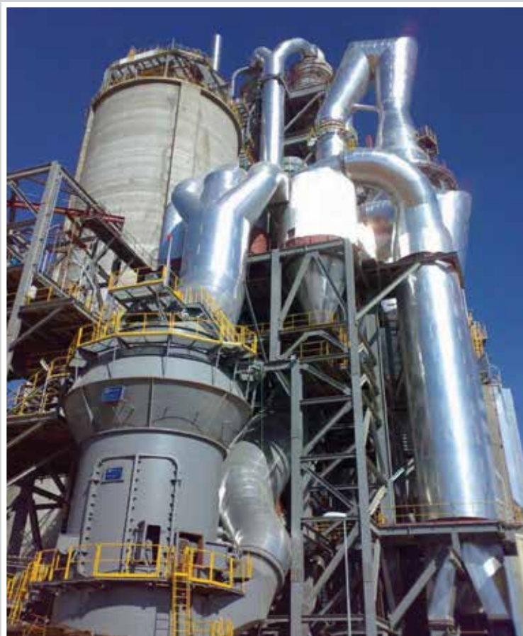
6000 TPD. FLSmidth Clinker Line1. RAMLIYA (Arabian Cement Suez)