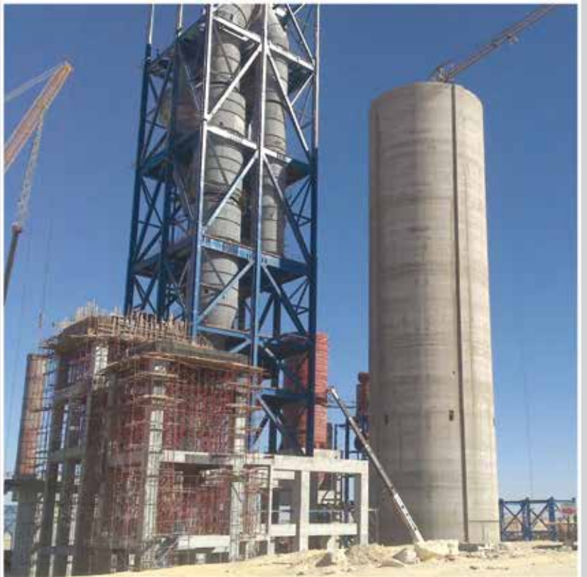
Wadi El-Nil Cement Co. (WNCC) Beni Suef - Egypt