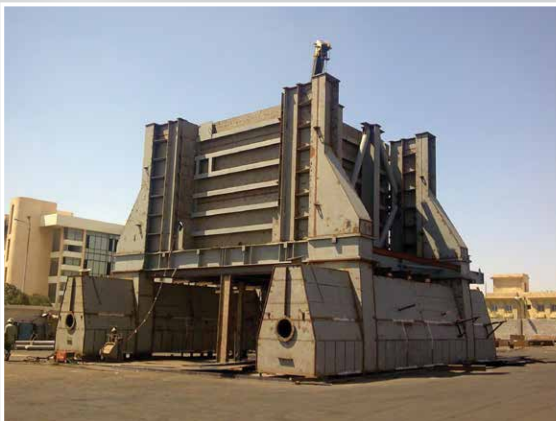
Vertical Crusher THYSENKRUPP FÖRDERTECHNIK GmbH (Norsk Stein / Jelsa, Norway )